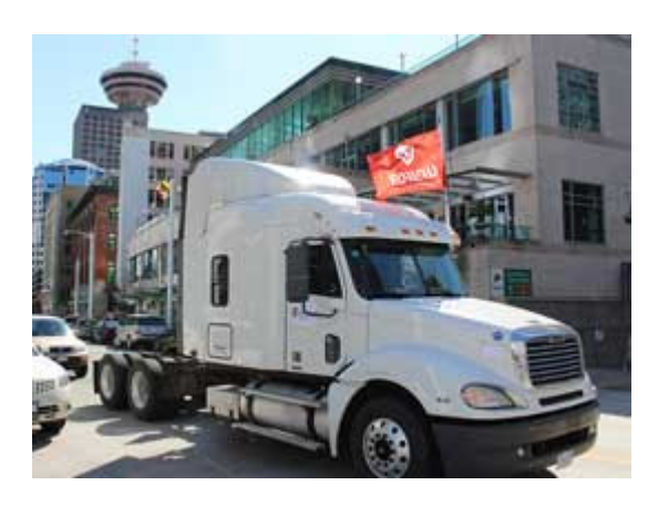
Port Metro Vancouver's plans to download more costs onto truckers is the wrong move and could lead to instability at Canada's busiest port.