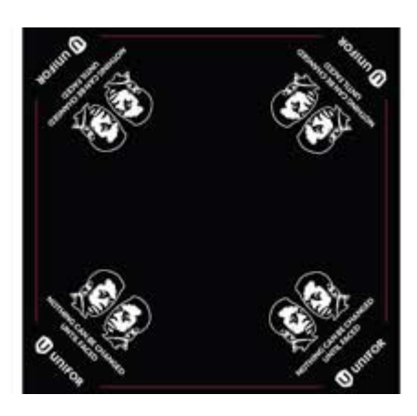
Unifor is offering locals a chance to order new bandanas based on U.S. civil rights activist James Baldwin's quote: "Nothing can be changed until faced," leading up to Unifor's 2nd-annual Racial Justice Day on Aug. 1, in recognition of Emancipation Day.