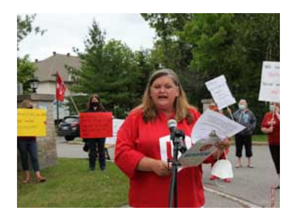
Watch Unifor's recent livestream to hear retirement home workers speak out against Chartwell in Kanata.